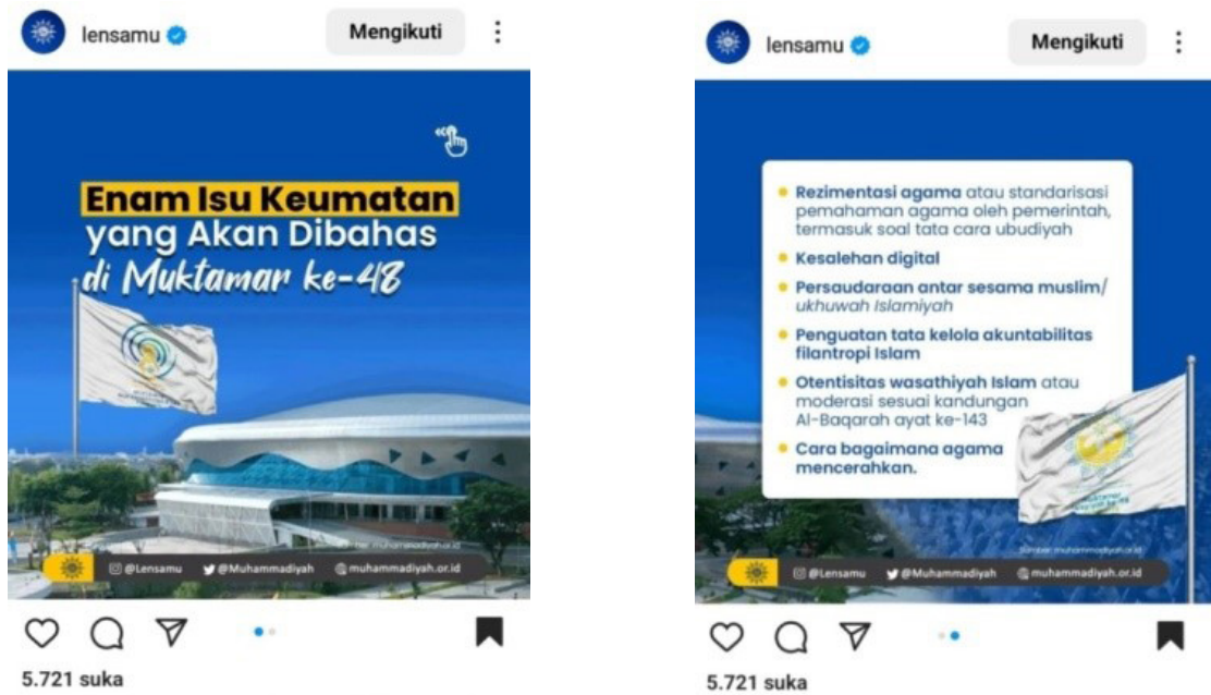
Figure 2. Muhammadiyah’s Official Posts on Instagram about Six Strategic Issues That Will be Discussed at the 48th Muktamar