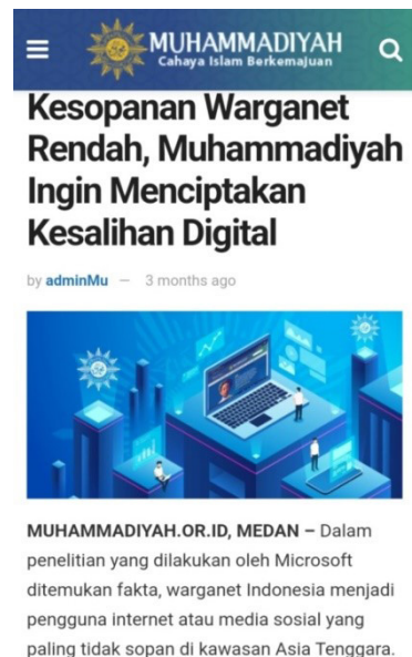
Figure 3. Muhammadiyah's Official Posts on Instagram and Website