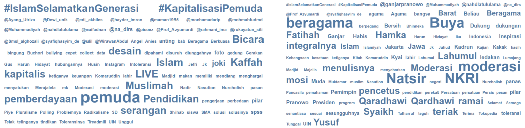
Figure 3: Top 100 Ranking Tweet Keywords of #moderati (left) and #moderat (right) on “Twitter”

appropriating the most frequently used keywords in discussions on religious moderation on X, as outlined below: