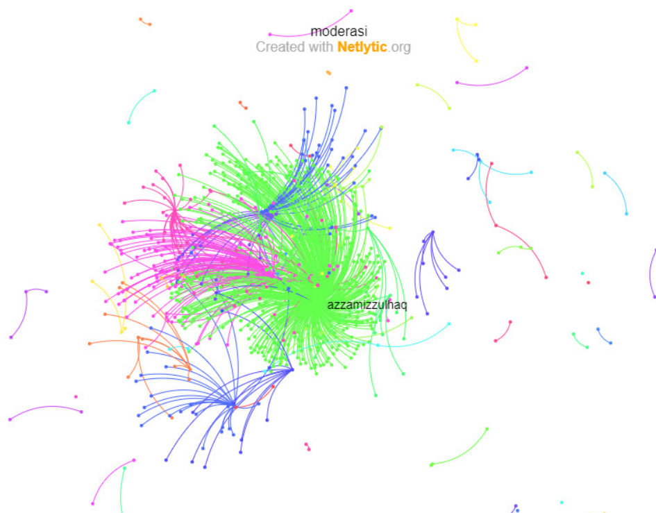
Figure 1: Visualization of Social Networks in the Hashtag Moderasi